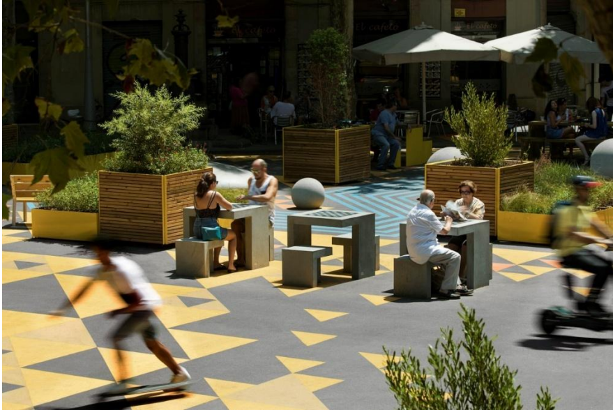
Superblock Sant Antoni.

At the end of the tour, the group will proceed by public transport to the meeting point for the @22 District Tour.